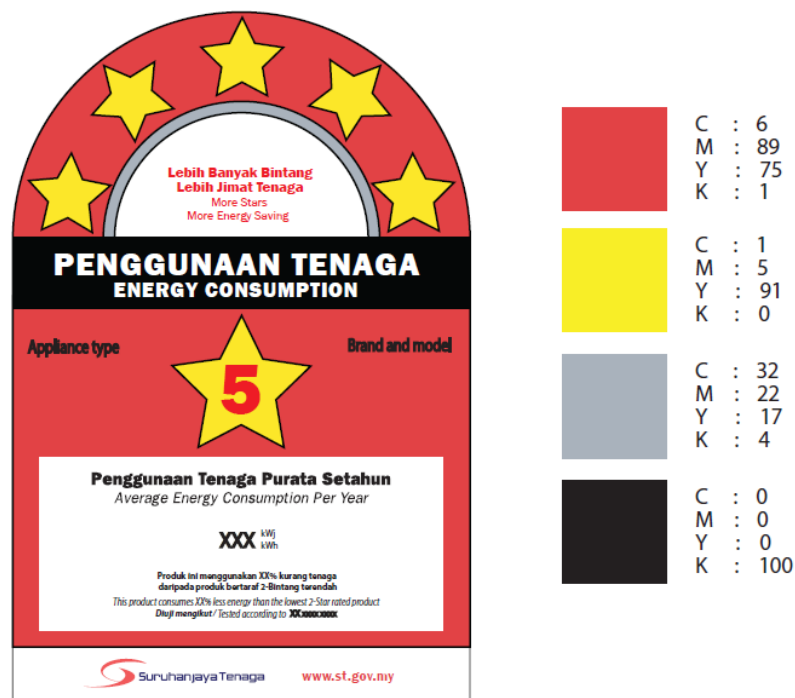
Figure 4:Color Specifications

The label shall be printed according to the colour specifications as follow: