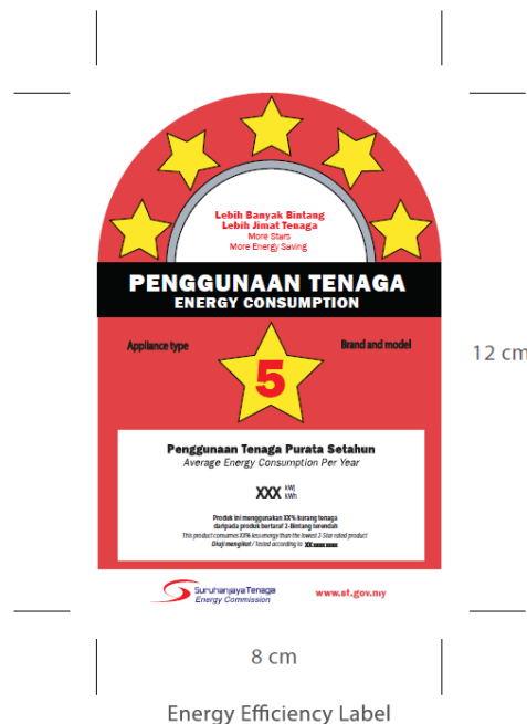
Figure 2: Size Specifications

Please refer to the picture below for the size specification