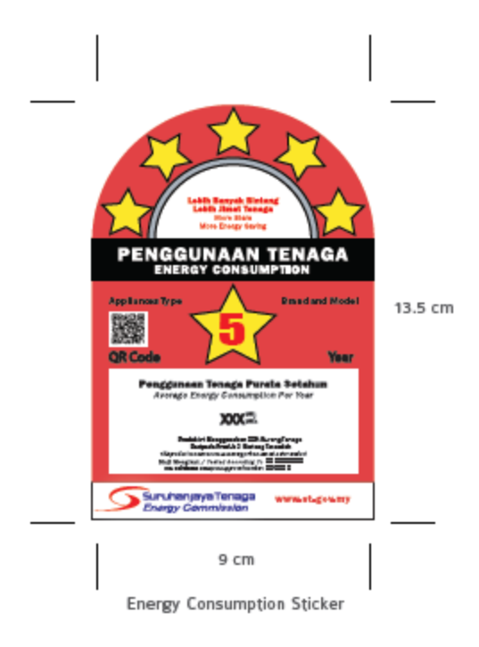
Figure 2: Size Specification

Please refer to the picture below for the size specification