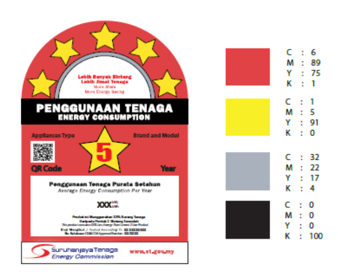
Figure 4: Colour Specification

The label shall be printed according to the colour specifications as follow: