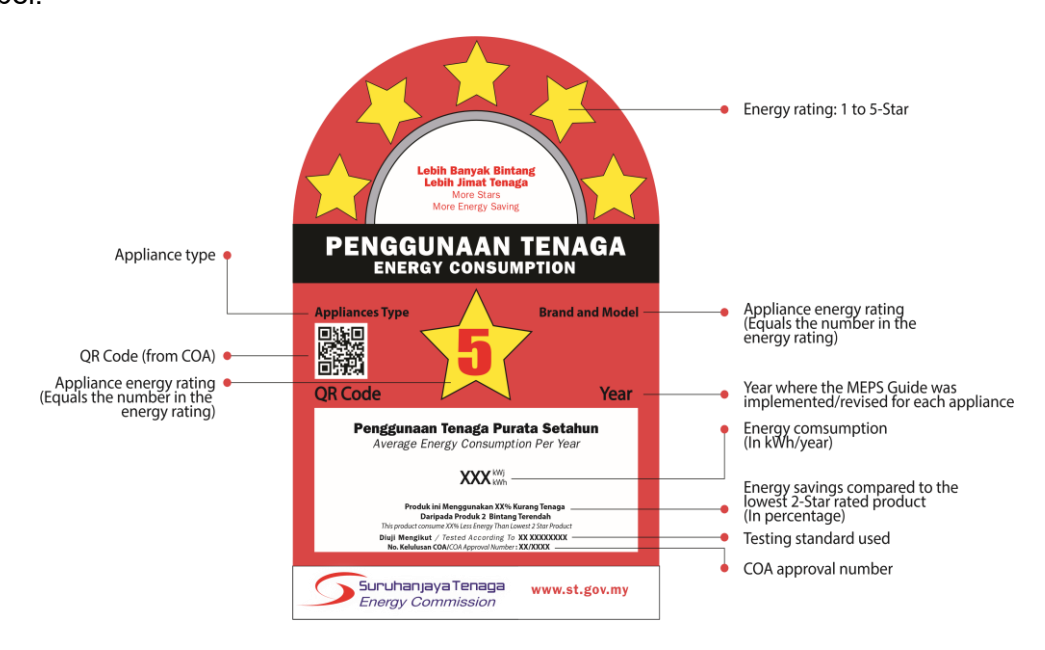
Figure 1: Information Required in the Label

Please refer to the picture below for the information that must be included in the MEPS label.