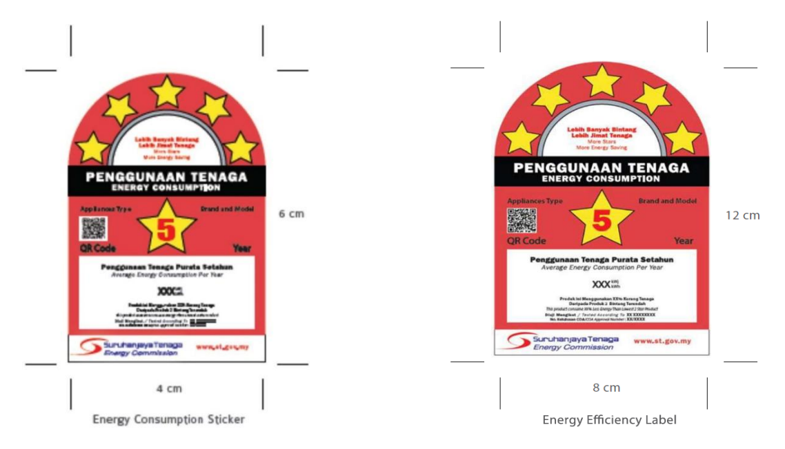
Figure 4 : Label size for rice cooker, microwave and fan

The size of the energy efficiency label is as per figure below.