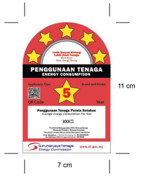
Figure 6: Label size specification for Electric Oven