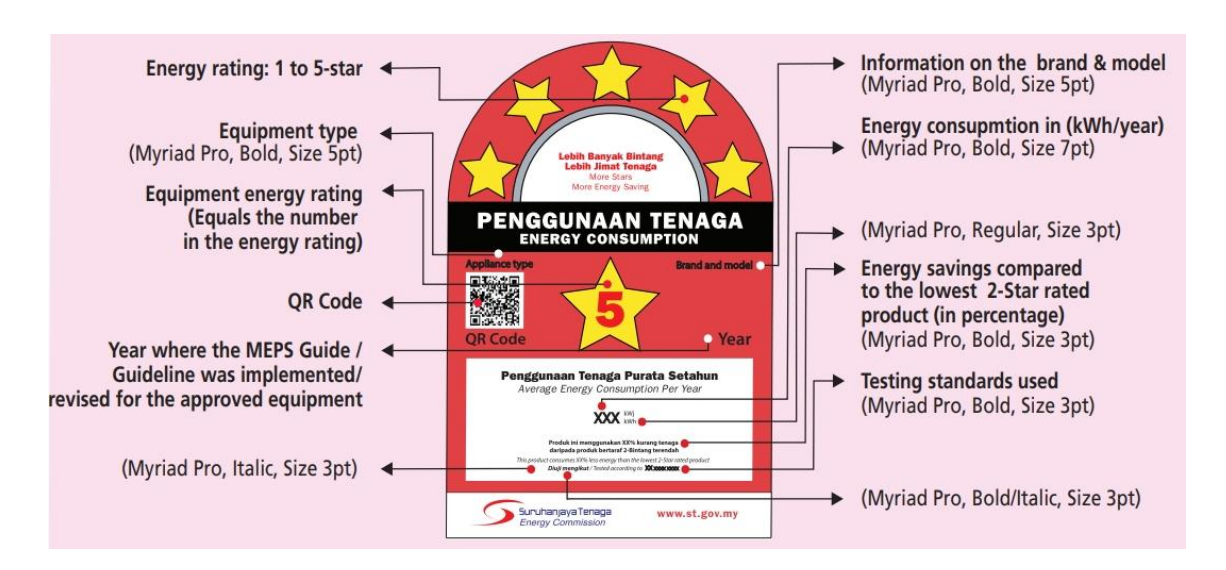
Figure 3 : Energy Efficiency Label

In accordance with the Energy Efficiency and Conservation Act, any equipment that meets all the requirements of efficient use of electricity shall be affixed with an efficiency rating label. It shall be the responsibility of the manufacturer or importer to affix such label. Information to be included in the label is as per Figure 3.