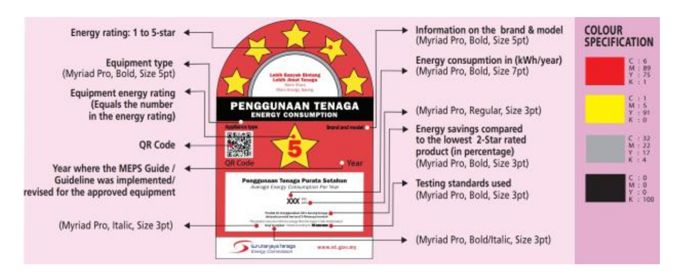
Figure 7: Font and Colour Specifications