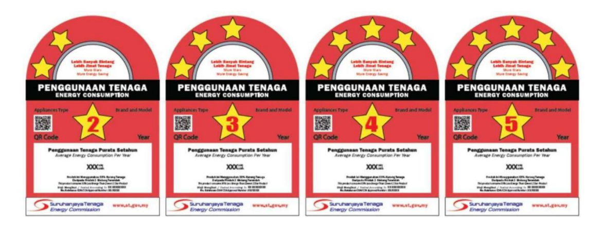
Figure 8 : Label design for 2-star to 5-star