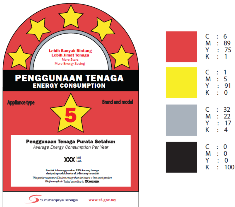
Figure 4: Colour Specification

The label shall be printed according to the colour specifications as follow: