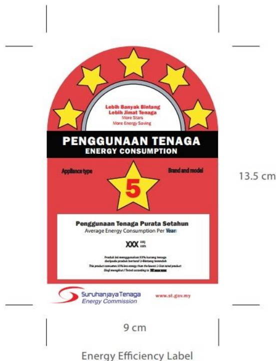
Figure 2: Size Specification

Please refer to the picture below for the size specification