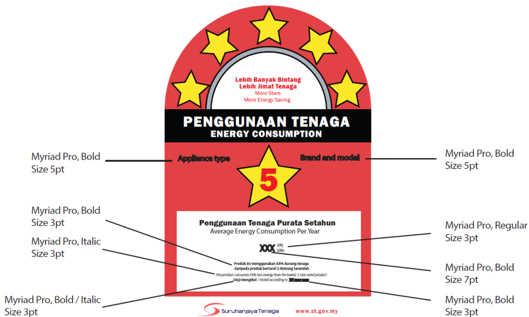
Figure 3: Font Specification