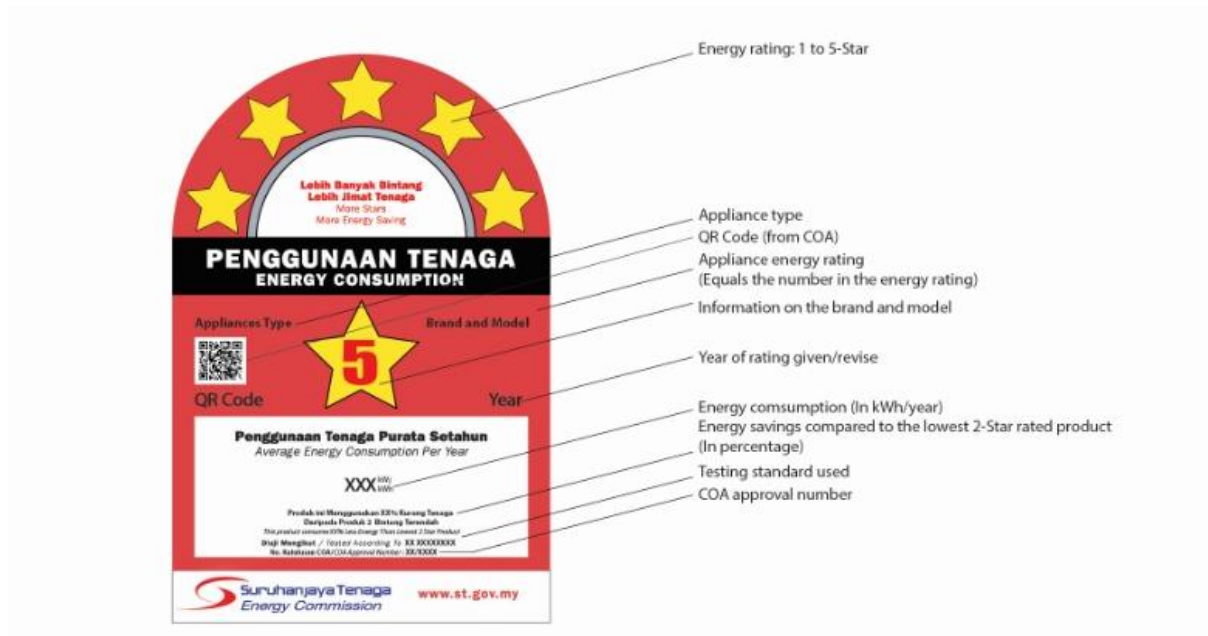
Figure 1: Information Required in the Label

Please refer to the picture below for the information that must be included in the MEPS label.