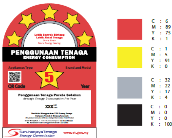
Figure 4: Colour Specification

The label shall be printed according to the colour specifications as follow: