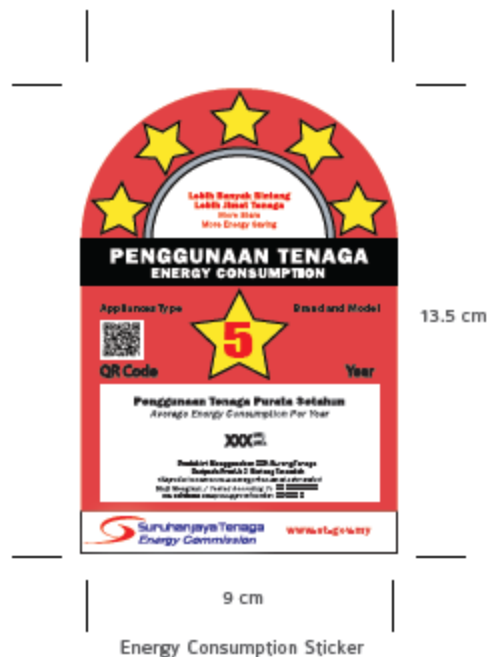
Figure 2: Size Specification

Please refer to the picture below for the size specification