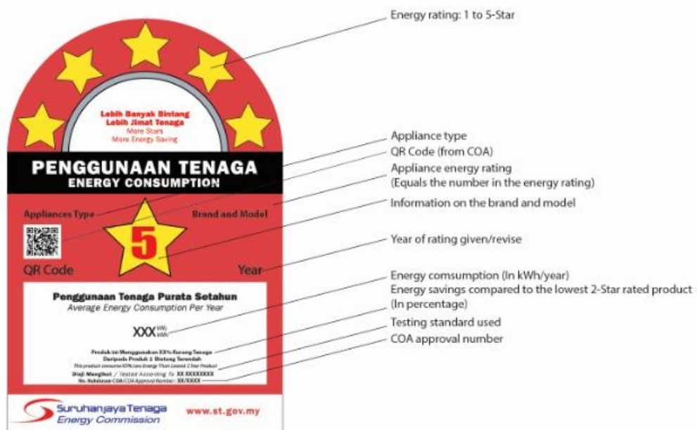
Figure 1:Information Required in the Label

Please refer to the picture below for the information that must be included in the MEPS label.