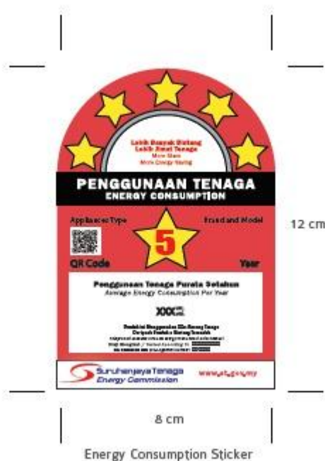
Figure 2: Size Specifications

Please refer to the picture below for the size specification