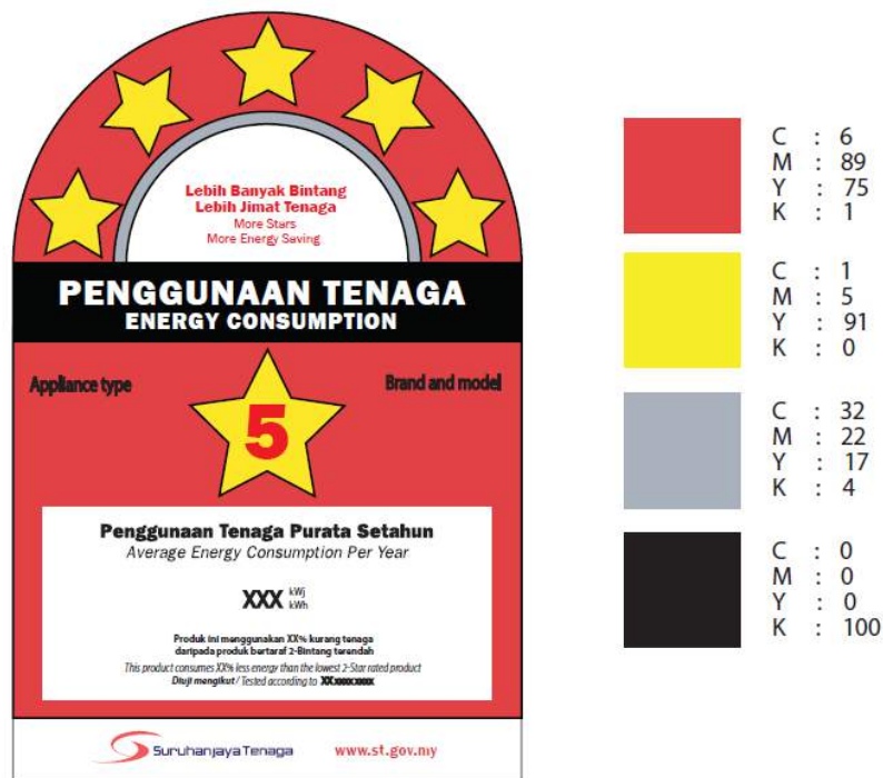
Figure 4:Color Specifications

The label shall be printed according to the colour specifications as follow: