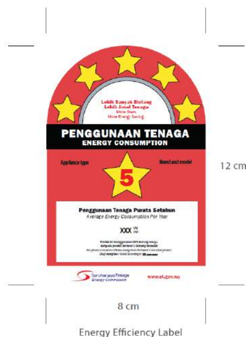
Figure 2: Size Specifications

Please refer to the picture below for the size specification