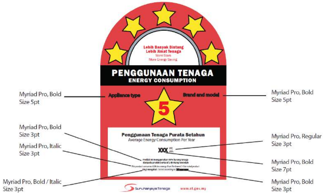
Figure 3:Font Specifications