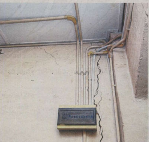
Faulty electrical sources are found to be the main cause of fires, with 877 cases reported in the past seven months.

with a systemering to YouTube videos. "They see it online and they try doing it without having proper knowledge. "They do not realise that it is very dangerous as it can cause electrocution," he said during an electrical safety discussion at Schneider Electric. Chew strongly warned the public not to use fake electrical and electronic products, such as imitation universal serial bus (USB) wires, chargers and power banks. He also recommended the people to learn about the operation of residual current device (RCD) to prevent casualties.