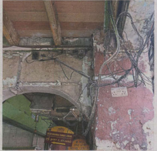
Building owners are advised to conduct checks on the electrical wiring in ses every 10 years